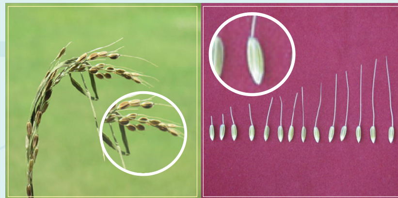
Panicle of Weedy rice