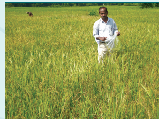
Collection of Weedy rice in Ganjam district, Odisha