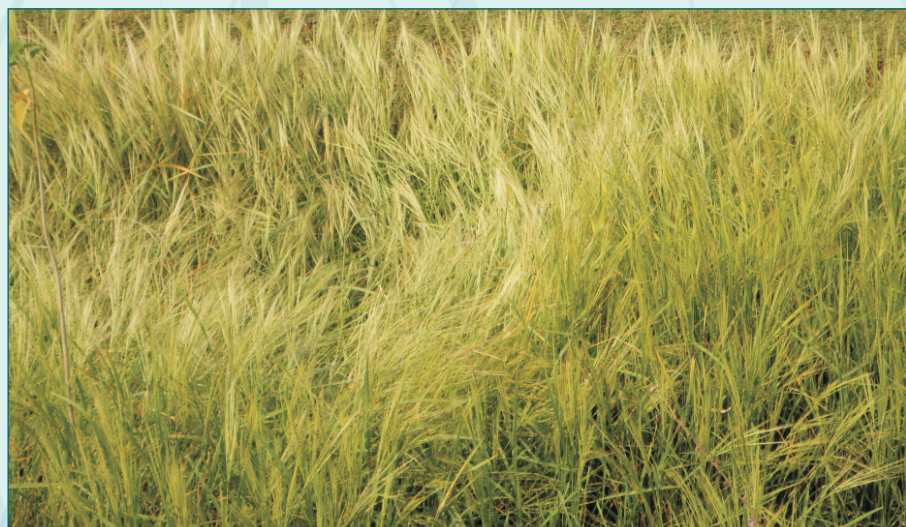
Complete devastation by Weedy rice

Weedy rice is a serious threat to rice farming. With the current crop management practices including direct seeding of rice, weedy rice infestation is likely to increase and will threaten sustainability of production systems in the country. Due to high competitive ability, these weeds can remarkably affect rice yields. Multiple approaches need to be integrated to reduce weedy rice infestation in fields. Further research is urgently needed to determine the impact of different tillage systems, water management and herbicide practices on weedy rice growth and control. Integrated crop management programs with different varietal aspects, such as crop plant density, row spacing, cultivars with good initial vigour and purple culm base need to be exploited as a component of integrated weed management in weedy rice control. Introduction of herbicide-tolerant varieties which allow the selective post-emergence control of weedy rice infestation can also be explored.