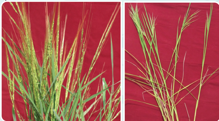
Oryza nivara and O. rufipogon , two abundantly occurring wild rices of eastern India

Weedy rice is produced either by spontaneous mutation from domesticated rice or through hybridization with wild Oryza species (viz., O. nivara , O. rufipogon and O. longistaminata ) which share the same genome 'AA' as cultivated rice. They easily cross with the cultivated O. sativa and O. glaberrima species and lead to development of natural hybrids i.e., weedy rice. Since phylogenetically the weedy form is closely related to cultivated rice, therefore, the weedy plants share most of the features of the two cultivated species viz., Asian rice ( Oryza sativa ) and African rice ( O. glaberrima ).