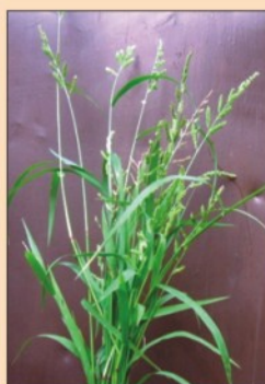
Echinochloa colona (Jungle Rice)- a predominant grassy weed in dry direct sown rice