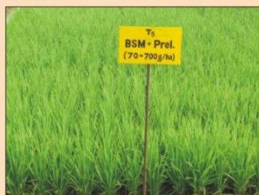
Bensulfuron methyl+Pretilachlor - promising herbicide for broad spectrum weed control in transplanted rice