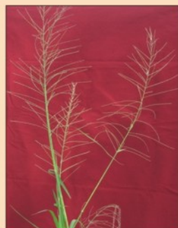
Leptochloa chinensis (Chinese Sprangletop)