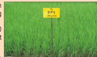
Bispyribac sodium -promising herbicide for controlling grassy weeds