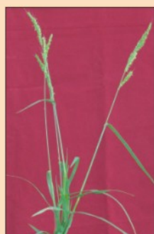
Echinochloa crus-galli (Barn yard grass)- a predominant grassy weed in rainfed transplanted rice