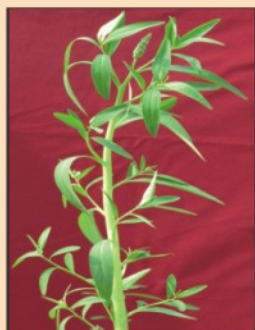
Sphenoclea zeylanica (Goose Weed)