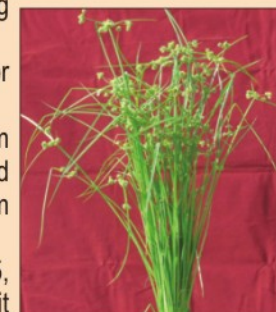
Cyperus difformis (Umbrella Sedge)- a predominant sedge in wet direct sown rice